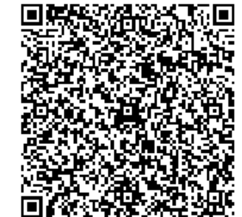
Allan's contact details